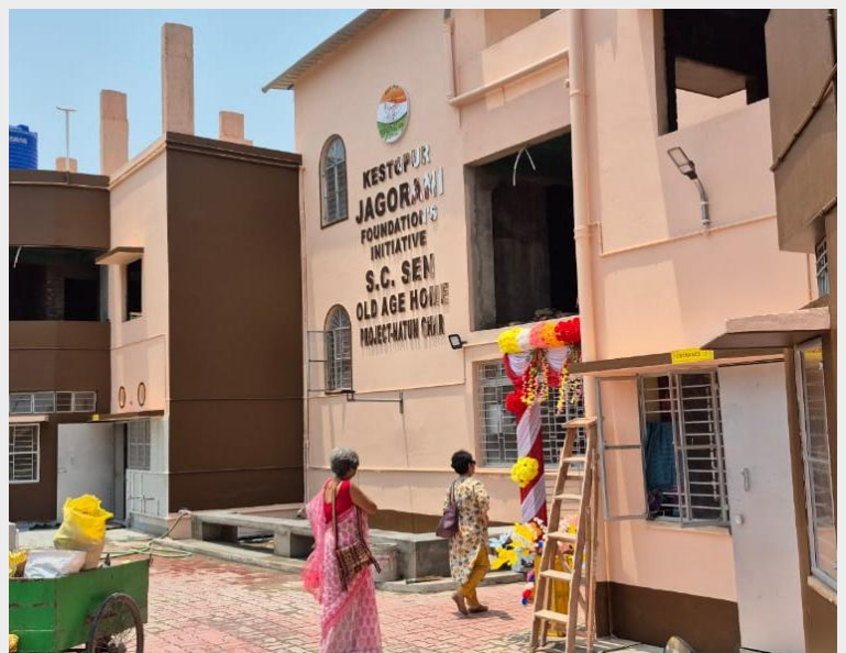
Visit to newly built Old Age Home at Sodepur, 26 th Apr'25